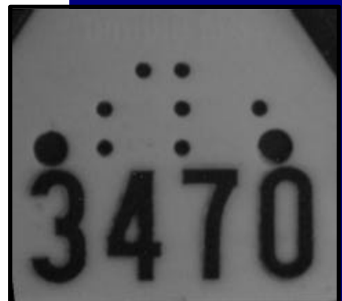
Machine Readable Ear Tags